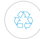
Battery Lifecycle Management