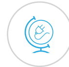
Universal Conditioning Chargers